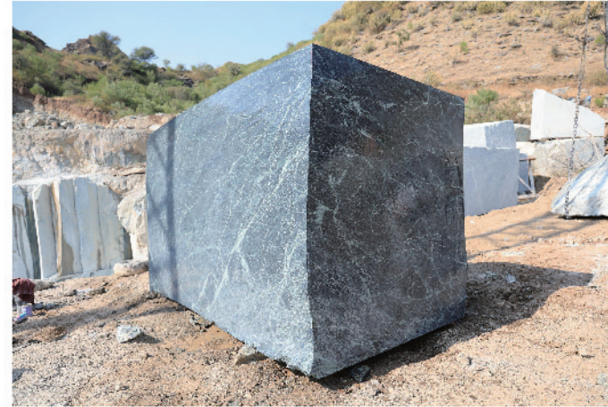
SPIDER GREEN MARBLE